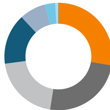
Top Sector Allocation (%)