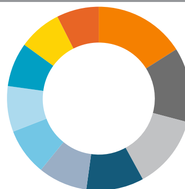
Top Sector Allocation (%)